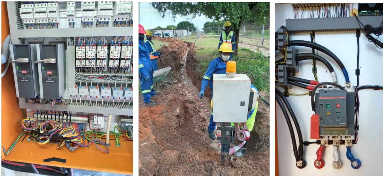
Figure below: Some of the original units on site, now refurbished