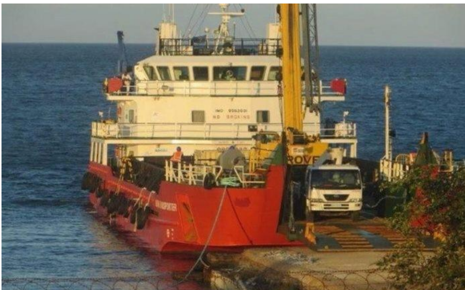
Mocimboa da Praia - First cargo delivery

The Port of Mocimboa da Praia, situated 80km from Afungi (where the LNG projects are being developed), received its first vessel on 13 June 2018, transporting a crane and container in preparation for handling the first cargoes of cement arriving for the LNG projects. See picture below.