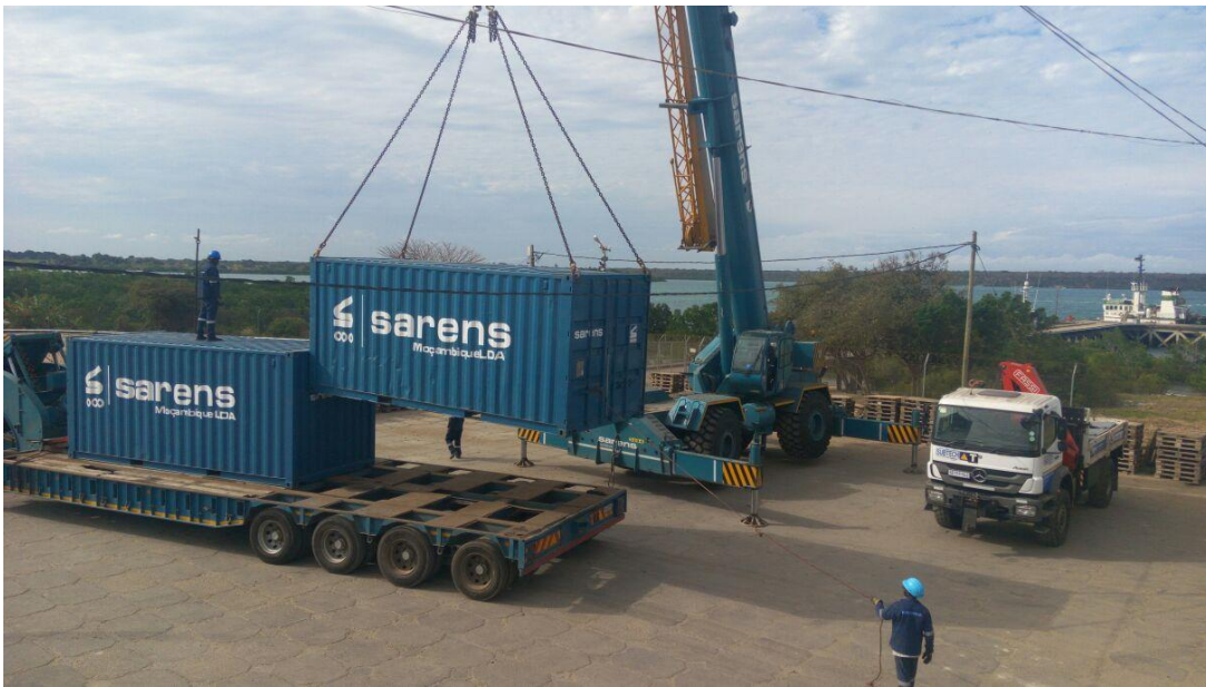
Mocimboa da Praia - Second cargo delivery

A potential camp and training centre facility for RBR has now been identified in Palma, within 5 kilometres of the Afungi site.